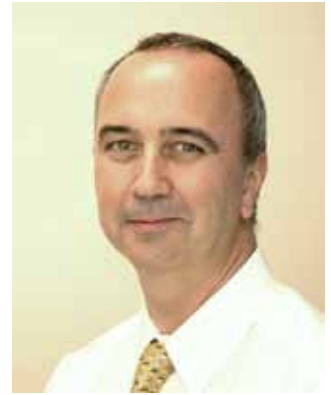
MARK SINESI, MD

In addition to standard radiation treatments, members of the department provide the latest treatment strategies, including altered fractionation schemes, interstitial implantation, high dose remote afterloading by outpatient and inpatient techniques, and intraoperative radiation. The department provides a full range of radiation oncology services, including external beam and radioisotope therapy. The department is also involved in institutional multi-disciplinary cancer research projects, as well as national projects.